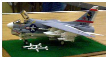
3 rd Alan Wright.