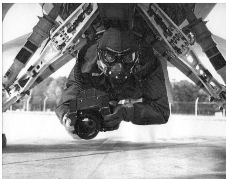
This was provided by 306 th Sqn RNeth AF- Its their new "manned recce pod" Flown under the F-16.

The sensor is fully steerable and can be reloaded and reprogrammed in flight by the operator.