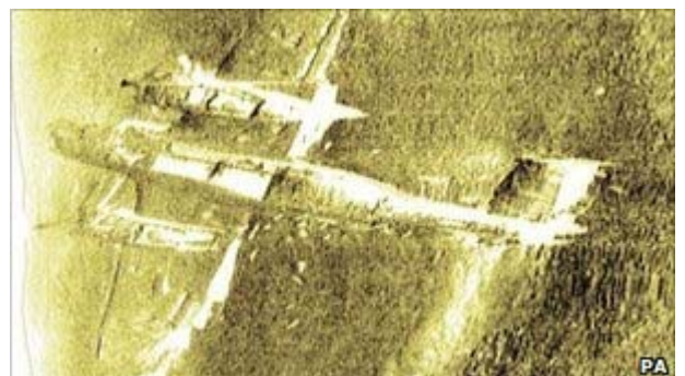
The bomber is said to be largely intact

He added: "The Dornier will provide an evocative and moving exhibit that will allow the museum to present the wider story of the Battle of Britain and highlight the sacrifices made by the