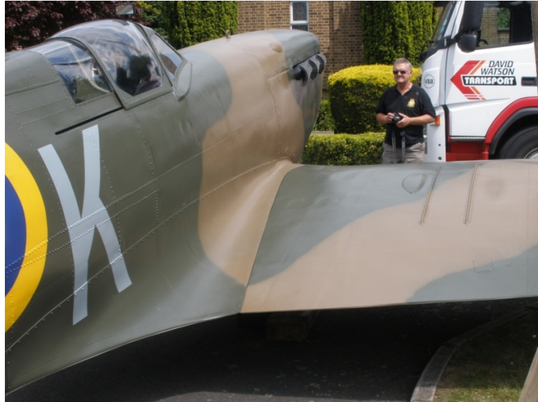
Can you spot the problem with this mock-up?