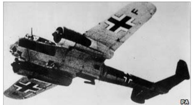
The aircraft, was shot down on 26 August 1940

It will go on display at the museum in London once it has been recovered.