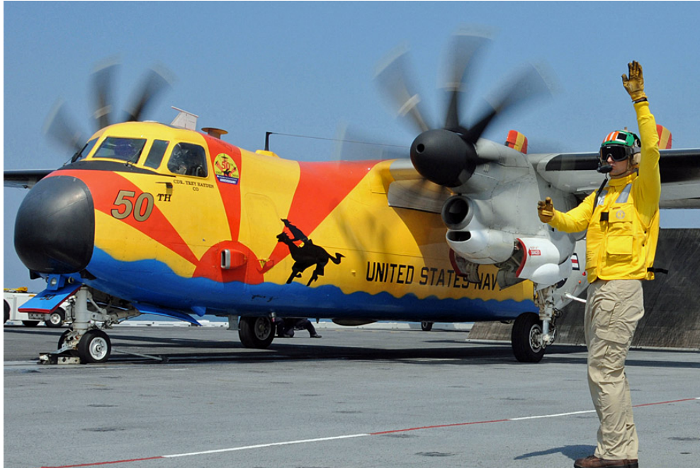
A Little Ray of Sunshine!