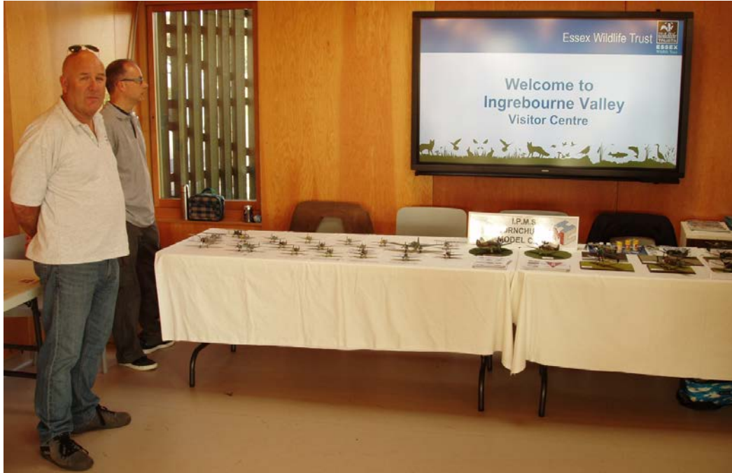
Keen, fit and ready to meet the public, or something like that!