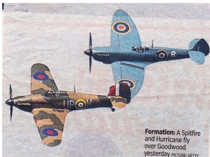
Formation: A Spitfire and Hurricane fly over Goodwood yesterday